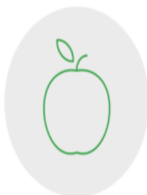
Performance of new fruit varieties

Focuses are on four thematic areas of critical importance to competitiveness and innovation potential of the European fruit sector: