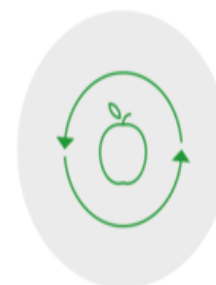
Secure sustainable fruit production