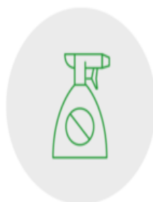
Reduction in pesticide residues