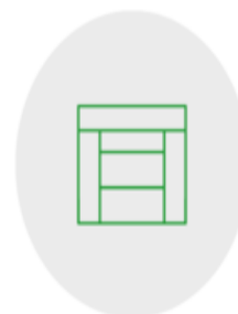
Fruit quality; improvement of fruit handling/storage