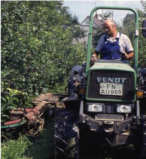
Figure 1 The first prototype of the equipment for successful tillage of the tree row with the pioneer fruit grower/designer.