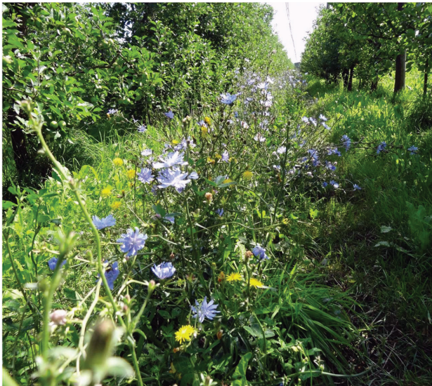
Figure 3 Weed strips with flowering plants in the middle of the alleys in an organic orchard in Southern Germany. Author J. Kienzle.

Biodiversity as a tool in plant health care strategies in OF offers a chance to extend these concepts into a combined management of functional biodiversity, and general issues of species biodiversity and nature conservation which offer great additional value to OF.