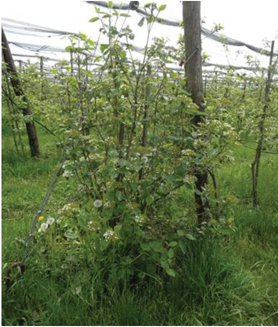
Figure 4 Single shrubs at the end of the tree rows can provide nectar and food for birds in winter. Author J. Kienzle.

There are a large number of recommendations to practice for such measures; however, implementation in practice is very low. The risks of negative side effects on the general orchard management are well known such as the increase of problems with voles and field mice or the resurgence of minor insect pests such as Ceresa bubalus or Amestategia glabrata and also diseases such as sooty blotch. Furthermore, the recommended measures often fail to reach the goals they are recommended for in terms of species and nature protection.